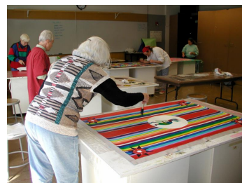
The Art Quilt Explored