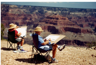
Introduction to Landscape Drawing