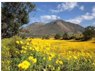
Wildflowers in Arizona