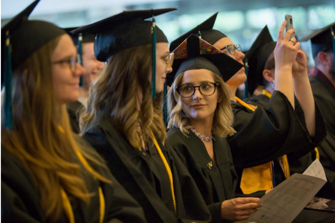
Student graduates celebrated one another during Commencement Ceremonies at Coconino Community College's Lone Tree Campus on May 11.