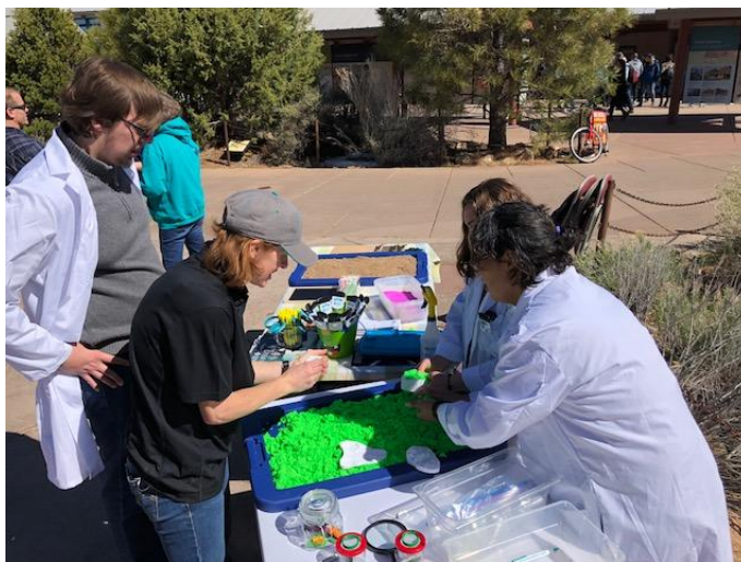
CCC students and faculty give science demonstrations at the South Rim on Earth Day this year.