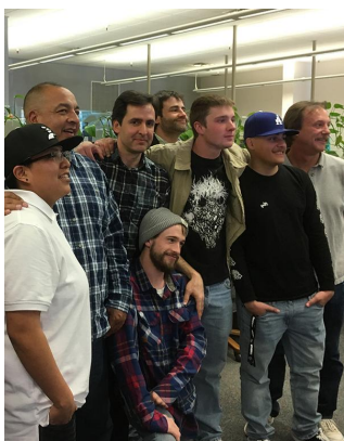
The newest CAMT graduates