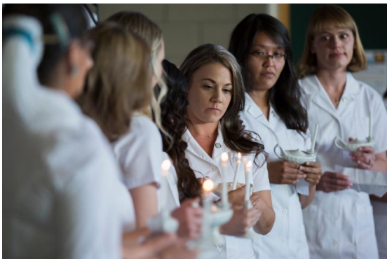
Nursing students took the Nightingale Pledge during a ceremony May 10 at CCC.