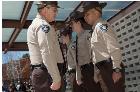
Detention Academy students completed the requirements of the Detention Academy in order to become Detention Officers at the Coconino County Detention Facility.