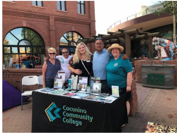
CCC and CCC2NAU staff greet ArtWalk guests during the July event in Heritage Square.

The First Friday ArtWalk happens the first Friday of the month, and the folks at the CCC booth would be happy for you to come by and visit.